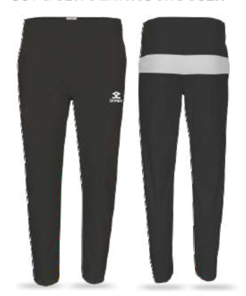
SHREY PERFORMANCE CUT & SEW PLAYING TROUSER