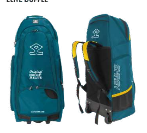
SHREY CUT & SEW ELITE DUFFLE