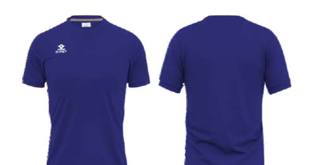
PRODUCT CODE:01 SIZES