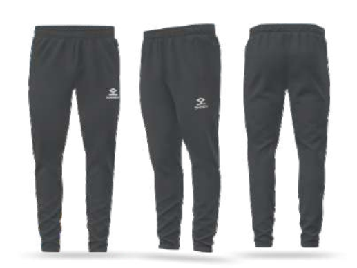
SHREY ELITE CUT & SEW TRACK BOTTOM