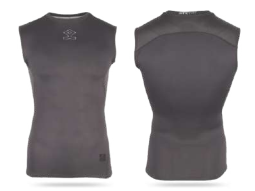
SHREY INSTENSE CUT & SEW BASELAYER SLEEVELESS TOP