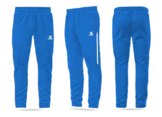
PRODUCT CODE :111